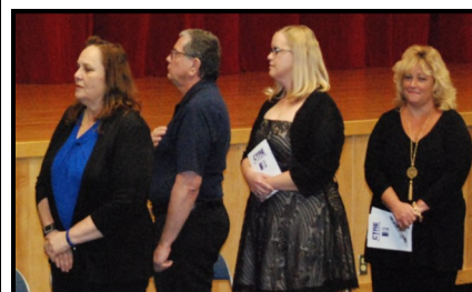
Above: Teachers and students pose on the PPHS Auditorium steps.